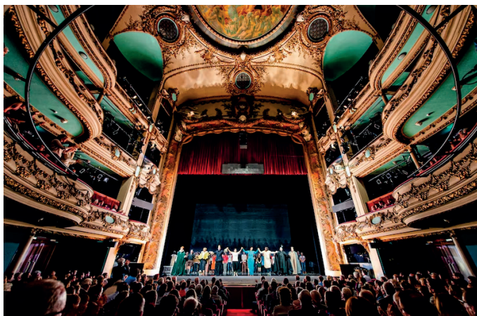
A Night at the Opera | Friday 19th May | 3:00pm